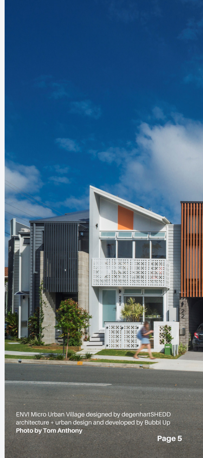
ENVI Micro Urban Village designed by degenhartSHEDD architecture + urban design and developed by Bubbl Up

CHIA NSW and Q Shelter Creating Sustainable Tenancies for Tenants with Complex Needs National Regulatory System for Community Housing Evidence guidelines January 2014. QGSO (2020) Queensland Region via https://statistics.qgso.qld.gov.au/hpw/profiles Queensland Shelter Queensland Community Housing Prospectus: A time for growth, November 2018 SGSEP https://www.sgsep.com.au/assets/main/Projects/SGS-Economics-and-Planning_RAI-Nov-19.pdf SGSEP Economic Impacts of Social Housing Investment https://www.communityhousing.com.au/wp-content/uploads/2020/06/20200197-SHARP-Final-ReportSGS.pdf?x65959