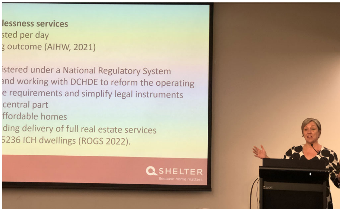
Fiona Caniglia addresses the EDQ Forum, 25 November 2022